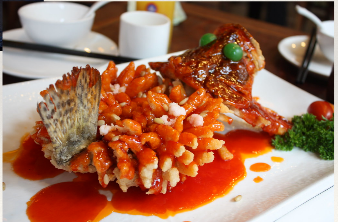
Sweet and sour fish (squirrel Fish)